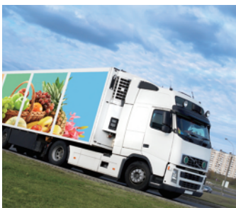
Cold Chain Trucks